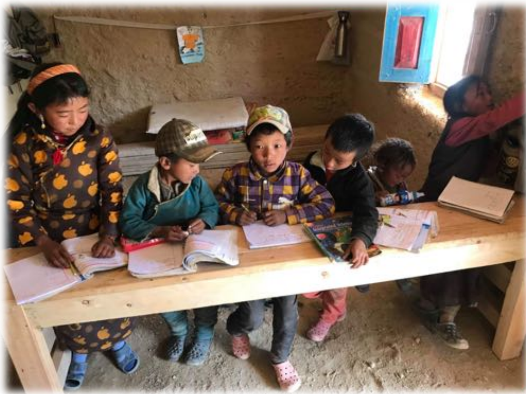
Students in the classroom

Apart from the regular government curriculum, the winter classes also teach the Dolpo dialect of the Tibetan language, basic Buddhist philosophy, cultural performances and arts. Currently, they have 28 students are enrolled in winter school with the support of 3 teachers. Our project aims at offering lectures to 30-40 students during the coming winter months. In the winter, to support students a small hostel is provided by school and cooks, firewood and food are provided by students' parent but other personnel like teachers and study materials are paid fully by the government, local bodies. Although, the past four years of Winter School were managed successfully with the support of parents and government, this year the school is in search of stable donor/supporter for Winter School since both the parent and government notified the school administration that they won't be able to provide a fund for winter school from this year