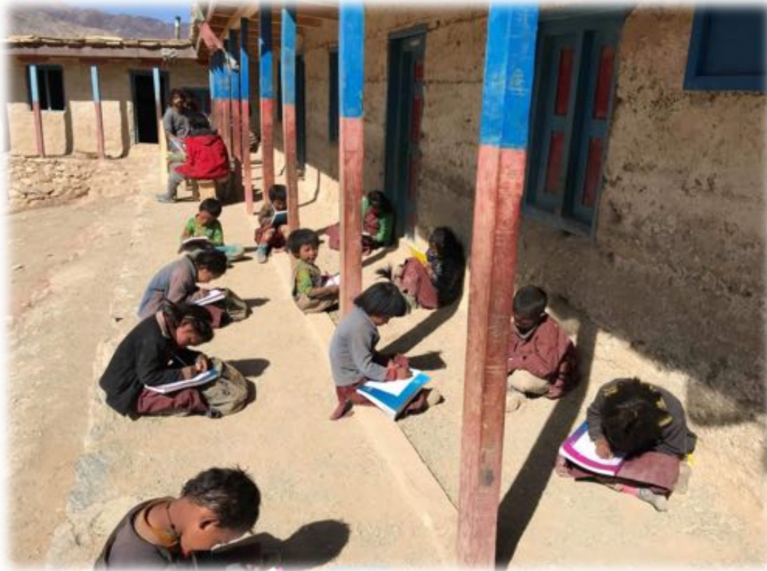
Students taking the class test outside the classroom on Sun

Yangjer Gumba Basic School located in Nyisal village within the Shey Phoksundo Rural Municipality was initially established in 1975 AD by Nepal Government. Before SYF (Snow Yak Foundation) founder Binod Shahi reopened the school in 2011, the school had remained closed for almost 35 years owing to irresponsible government teachers and unaware locals. SYF now runs classes up to grade 5 in the school with SYF fellows working as teachers during the summer. The school mostly has students from Nyisal and nearby villages Musi and Luri. Lack of proper classrooms, teaching materials, library and toilets still pose as challenges for the school.