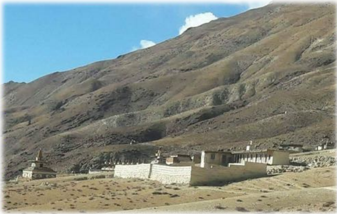
Shree Yanjer Gumba Basic School

Nyisal is a tiny village at 3800m altitude which holds Yangjer Gonpa one of the oldest Monastery of Dolpo within the Shey Phoksundo rural municipality in the Dolpo Region close to the Tibetan border. It is located approximately one walking week from the district headquarter Dunai & airport of the region Jupal and all the transport is done by mules and yaks. Due to the extreme remoteness of the Dolpo region makes it very difficult to deliver basic education throughout the year. The existing schools in this region are not equipped with proper teaching tools and facilities, even though several NGOs and local individuals are working toward running these schools but still, the schools remain closed in winter time due to the extreme weather in winter and also due to limited fund to run winter classes i.e. the regular school only runs for six- seven months.